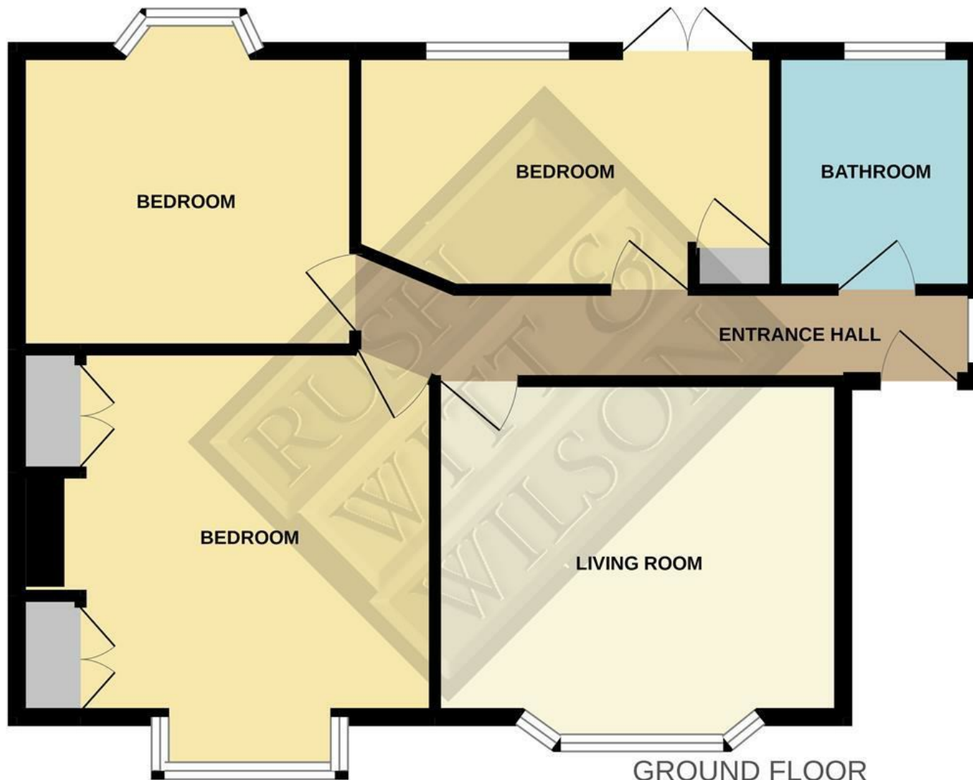
GROUND FLOOR 647 sq.ft. (60.1 sq.m.) approx.

TOTAL FLOOR AREA : 647 sq.ft. (60.1 sq.m.) approx.